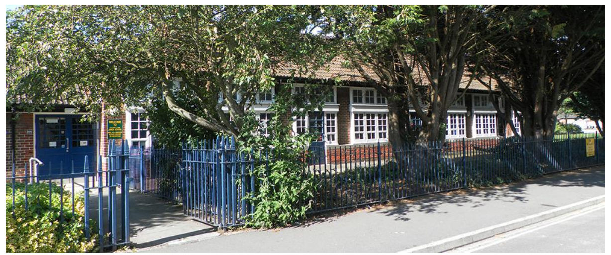
Court Lane Junior School

In the Parish of Farlington, we are part of the local community with many links into local activities. Clergy and members of the congregation are closely linked with the local schools and they frequently visit the churches.