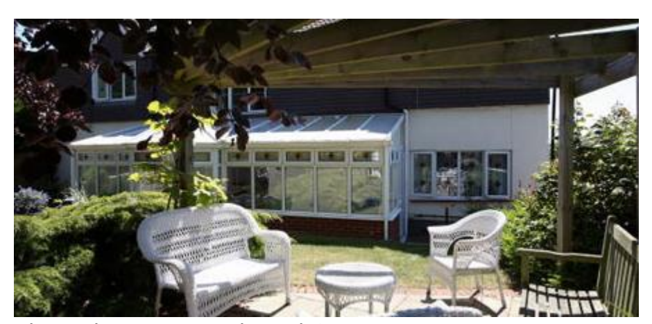
Alexandra Rose Residential Care Home

We take services in the residential homes for the elderly.